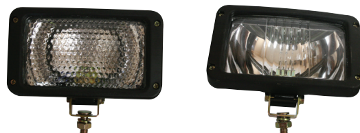
725065 / *725084

These lamps contain a highly polished reflector, manufactured using high heat and vacuum formation. The lamp housing is a durable and rugged nylon composition. The steel plated mounting bracket is fully adjustable for any suitable location.