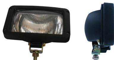
725064 / *725083