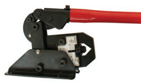
762627 Bench Mount Crimp Tool