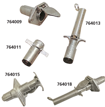
6-Pole Trailer Connectors (Heavy-Duty)